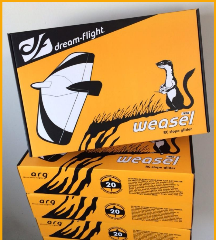
Ready for retail - colorful and informative packaging is ready to stand out on the hobby shop shelf.