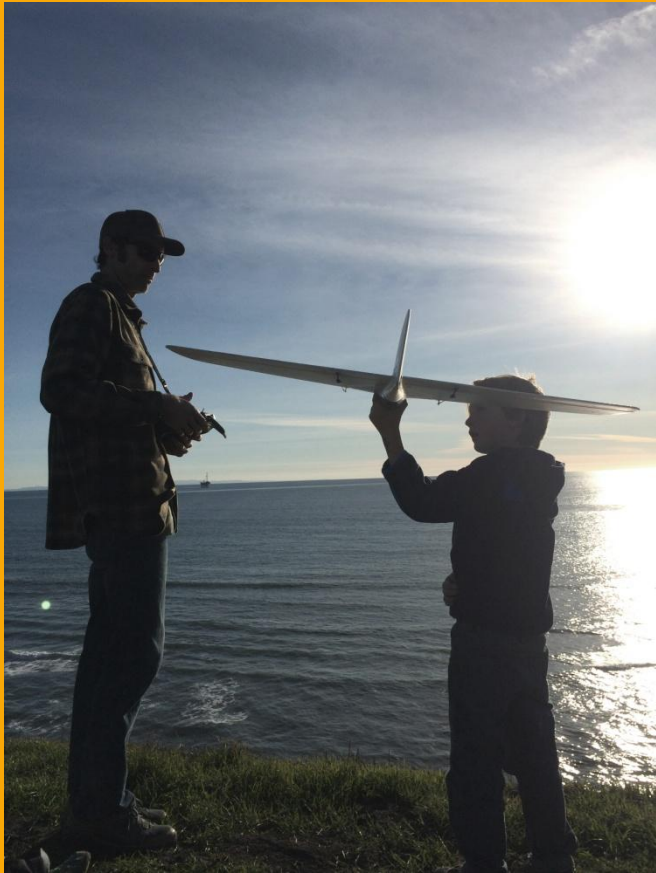
The Weasel-TREK's compact, lightweight airframe offers non-intimidating slope performance to pilots of all skill levels.